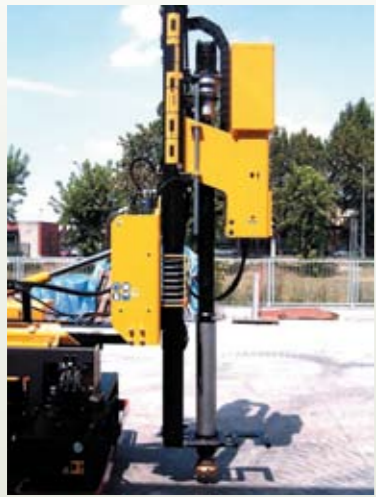
DOWN THE HOLE HAMMER