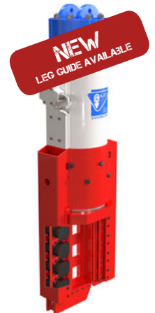
Leg guide for sheet piles, H, tubes, wooden piles